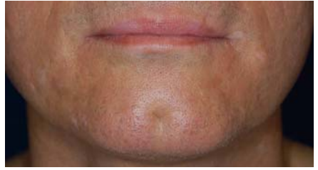
... and after treatment

Different types and variations of vitiligo require individual treatment concepts!