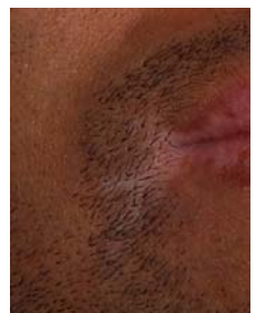
... 6 months after PTx