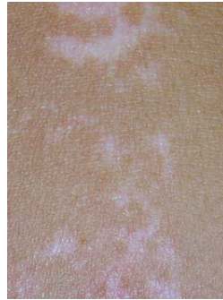
... after 10 x Excimer laser sessions