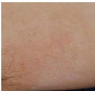
... and after Excimer treatment

Quality of life in vitiligo is often reduced significantly, and patients suffer strongly from their disease. In close cooperation with our patients we work out a treatment plan depending on duration, cause and intensity of disease. Therapeutic strategy is based on new scientific knowledge.